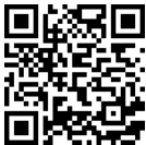
K120-EX 3D demo