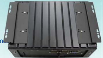
Wall mount kit