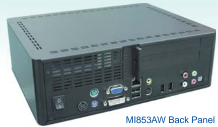
Mi853AW Back Panel