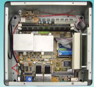
MiTex-P Chassis without top-cover

Application : Embedded IA, VOD, Video server, Security, Home MIDI, ATM, Panel PC and POS, Kiosk application