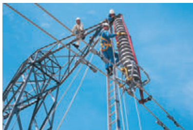
Utilities and process control centers