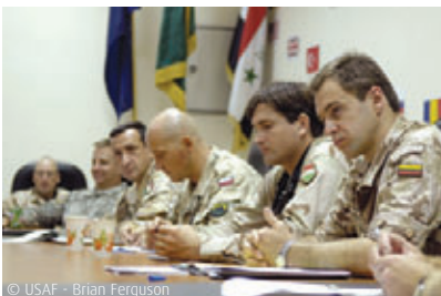
Command and Control environments