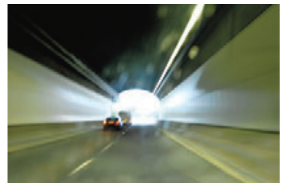
Traffic & surveillance