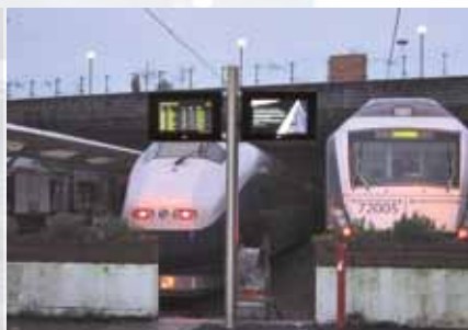
Stavanger Train Station / Norway