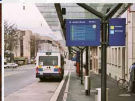
Zug Bus Terminal / Switzerland