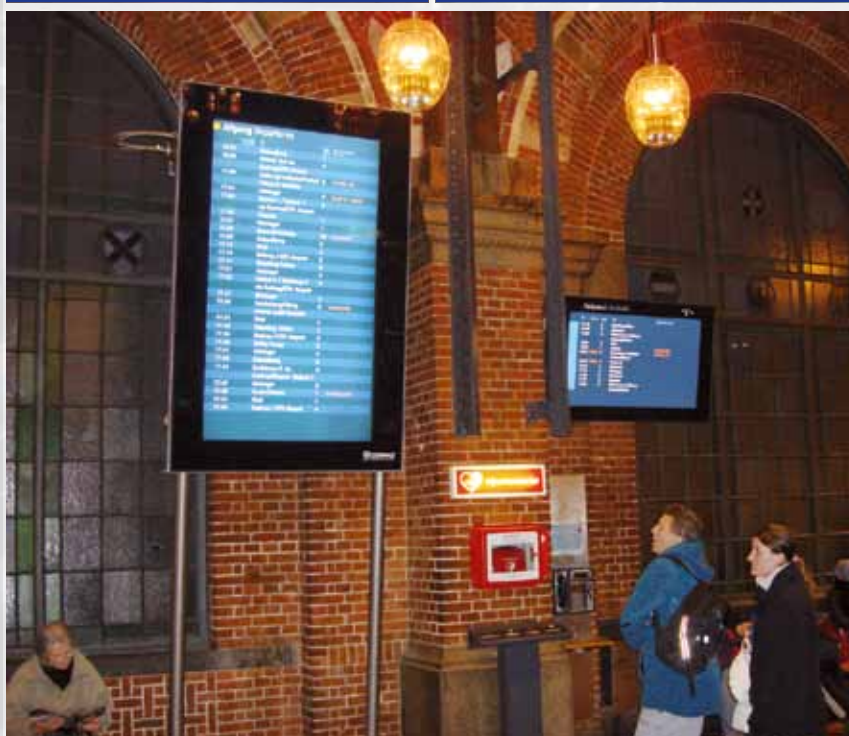
Copenhagen Train Station / Denmark