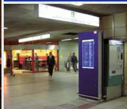
Frankfurt/Main Train Station / Germany