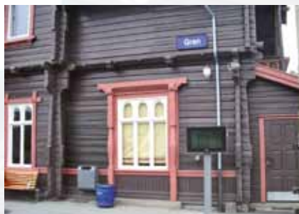
Gran Train Station / Norway