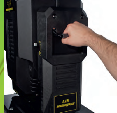
Easy Carry yoke-arm handles