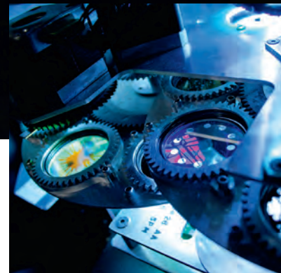
14 glass rotating gobos

The information and data given are typical for the equipment described. However any individual item is subject to change without any notice. The latest version of this brochure can be found on www.highend.com .