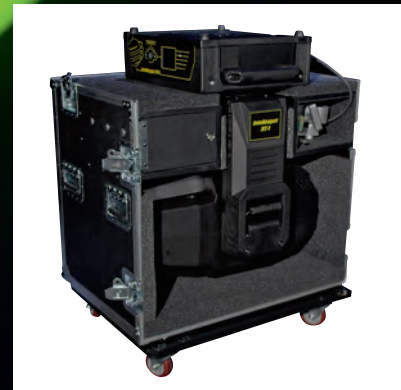
Optional Touring Roadcase