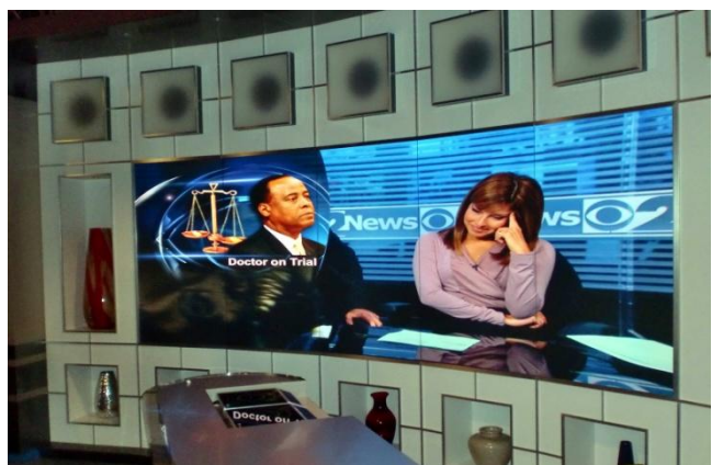
[Broadcasting] 1x5 Portrait New York, USA