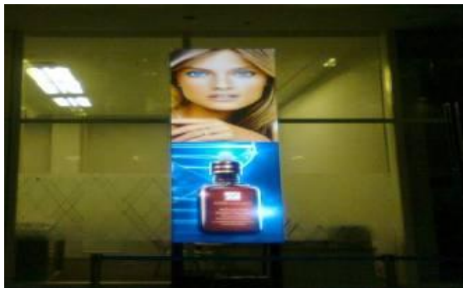
[Retail] 2x1, Thailand