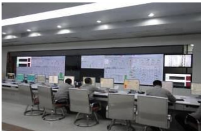
[Control Room] 2x4 Urumchi, China