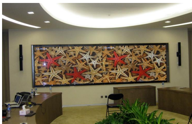
[Corporate] 2x4 Beijing, China