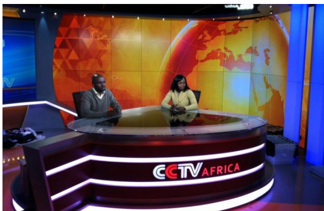
[Broadcasting] 2x10 Portrait Nairobi, Kenya