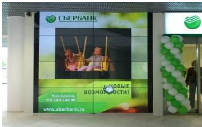
[Retail] 4x2, Russia