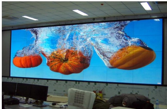
[Control Room] 4x7 Lanju, China