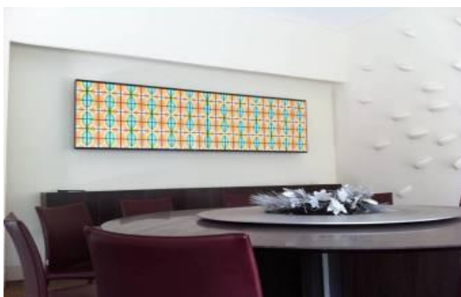
[Corporate] 2x5 Nanjing, China