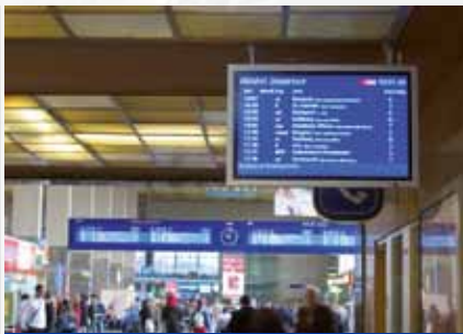
Vienna Train Station / Austria