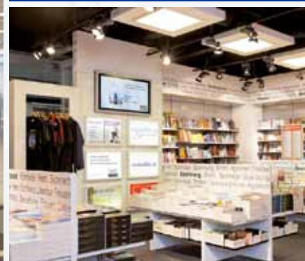
Book shop Hollmann, Duesseldorf / Germany