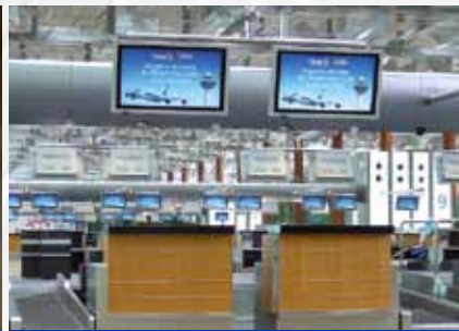
Changi Airport Singapore / Singapore