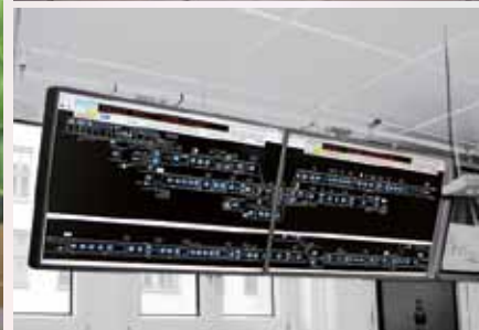
Horizontal cluster of 2