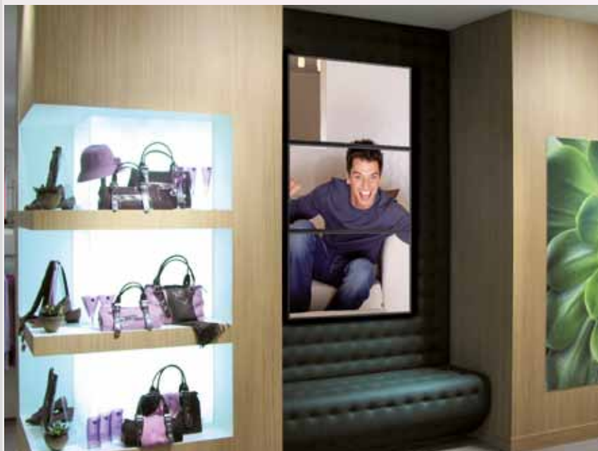
Vertical cluster of 3