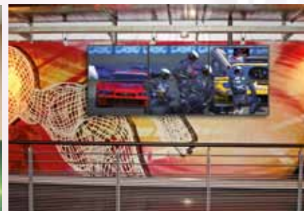
Cluster of 6