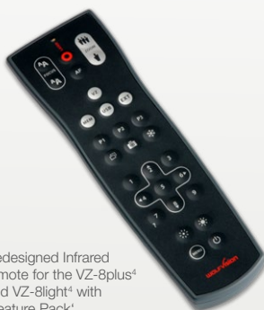
Redesigned Infrared remote for the VZ-8plus 4 and VZ-8light 4 with 'Feature Pack'.